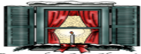
Remember Our Shut-ins

It is not doing the thing we like, but liking the thing we have to do that makes life happy!