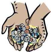
Tithes and offerings

This is for all of you Dryland members out there who are into the world of electronic media, cell phones, I-pads, etc. Do we have good news for you!!