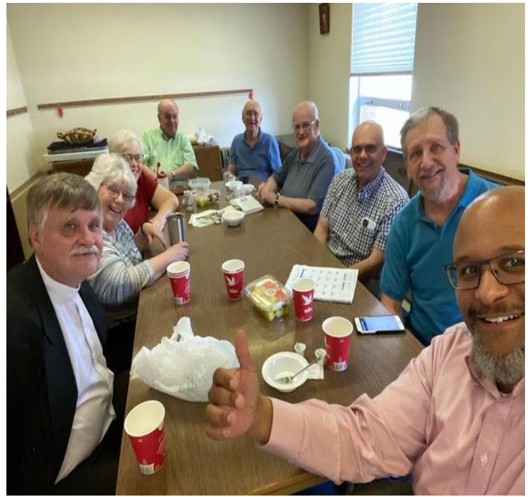
Some of the clergy from UCC East Area Ministerium Council meeting at Dryland, June 2023.