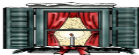
Remember Our Shut-ins

When doubt knocks at the door, let faith answer!