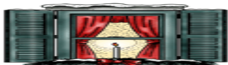
Remember Our Shut-ins