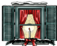
Remember Our Shut-ins

The memories we collect and give, brighten our lives as long as we live!