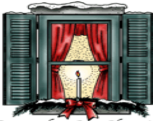
Remember Our Shut-ins

Janet Day – 1/29/35, Fellowship Community, Room 271, Terrace 3000 Community Drive, Whitehall, PA 18052