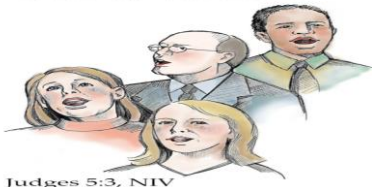
Judges 5:3, NIV