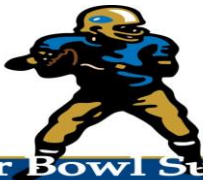
Super Bowl Sunday

What made us friends in the long ago, when first we met? Well, I think I know, The best in me and the best in you!