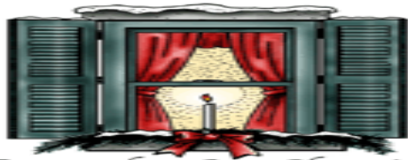
Remember Our Shut-ins