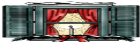
Remember Our Shut-ins