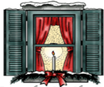
Remember Our Shut-ins

Janet Day – 1/29/35, Fellowship Community, Room 271, Terrace 3000 Community Drive, Whitehall, PA 18052