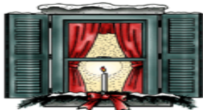
Remember Our Shut-ins

Janet Day – 1/29/35, Fellowship Community, Room 271, Terrace 3000 Community Drive, Whitehall, PA 18052