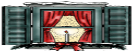
Remember Our Shut-ins