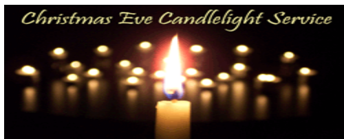
Christmas Eve Candlelight Service