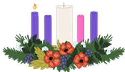
First Sunday of Advent