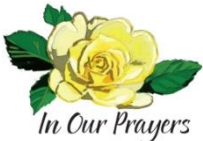
In Our Prayers

Some people are kind, polite, and sweet- spirited, until you try to sit in their pews!