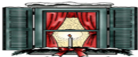
Remember Our Shut-ins