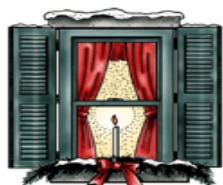
Remember Our Shut-ins

There's a race to be run, There's a victory to be won, Every hour, give me power To go through!