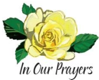
In Our Prayers