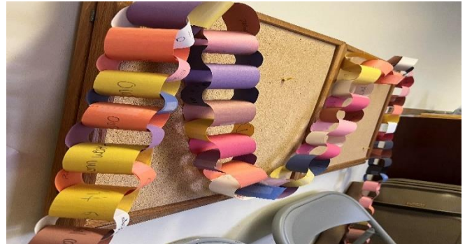
DRYLAND PRAYER CHAIN - GANG